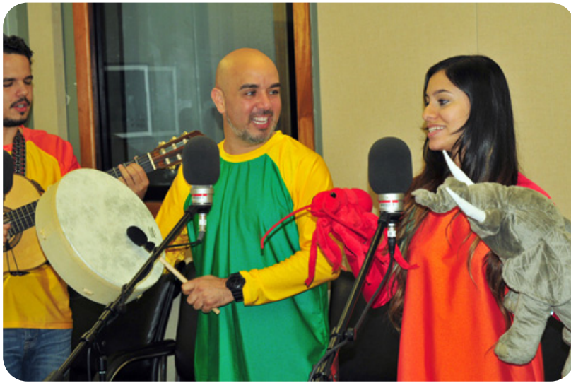
Música para despertar.